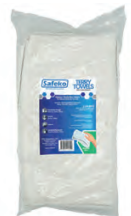
Cotton Terry Towel - 24 PACK BAG