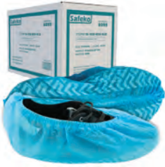
Shoe Cover - Anti-Skid With Sole Elastic