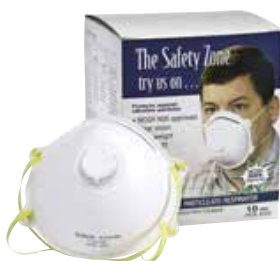
N95 DUST MASK

N95 dust mask with valve protects against ultra fine particles.