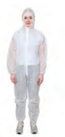
Elastic Polypropylene Coverall with Hood