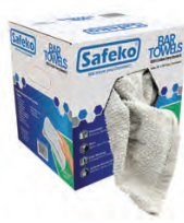
Cotton Terry Bar Towel - 5 LBS CASE