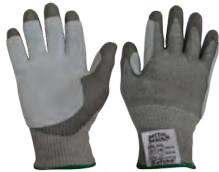
Leather Palm PU Coated