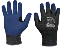
Black Blue Nitrile Palm