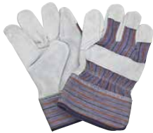
Safety Cuff Leather Glove

Dotted machine string knit cotton glove good for handling parts & light to medium duty assembly work. One size fits most.