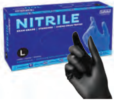
Nitrile Examination Glove - 5.5 Mil Heavyweight