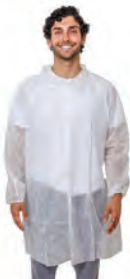
Non Woven Lab Coat