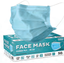
3 Ply Disposable Face Masks