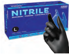
Nitrile Examination Glove - 3 Mil Lightweight