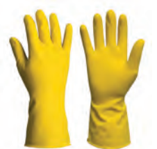
Latex Flock Lined 16 MIL Beaded Cuff