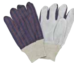
Leather Palm Knit Wrist Glove

Heavy duty leather glove. 2 1/2" safety cuff. One size fits most.