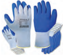
Latex Palm Coated Glove - Crinkled