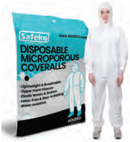
Elastic Microporous Coverall with Hood