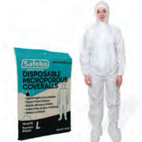
Elastic Microporous Coverall with Hood and Boots