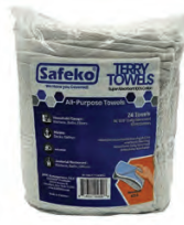
Cotton Terry Towel - 2 LBS BAG