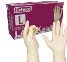
Latex Exam Grade Glove