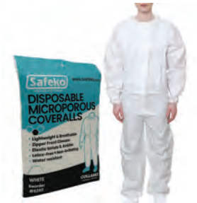
Elastic Microporous Coverall - Collared