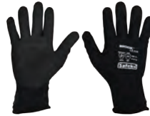
Lightweight Black Nitrile Palm