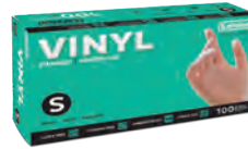
Vinyl General Purpose Glove