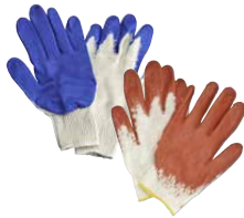
Knitted Gloves Colored

String knit cotton glove with vinyl coating. One size fits most.