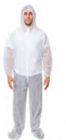
Elastic Polypropylene Coverall with Hood and Boots