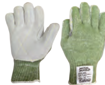
Heavyweight Green Leather Palm