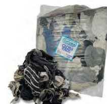
Colored T-Shirts Cloth Rags - 10 LBS Bag