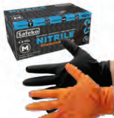
Nitrile Examination Diamond Grip Glove