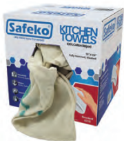
Cotton Striped Kitchen Towel