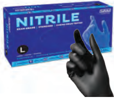
Nitrile Examination Glove - 4 Mil Standard