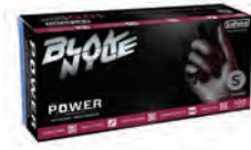
BLAK NYLE GP Glove