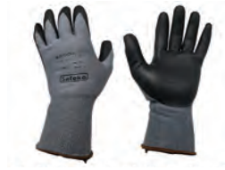
Gray Lightweight Nitrile Palm