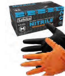
Nitrile Industrial Diamond Grip Glove